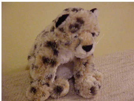
Columbus Cheetah - Mythbuster