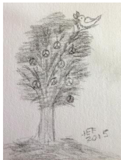
Peace Jo Freitag

ASRC program http://www.asrc.org.au/home/our-services/how-we-help/community/schoolsprogram/